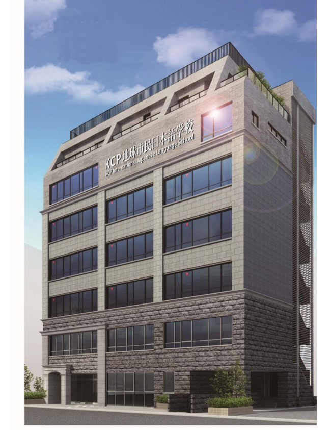
KCP Campus in the heart of Tokyo